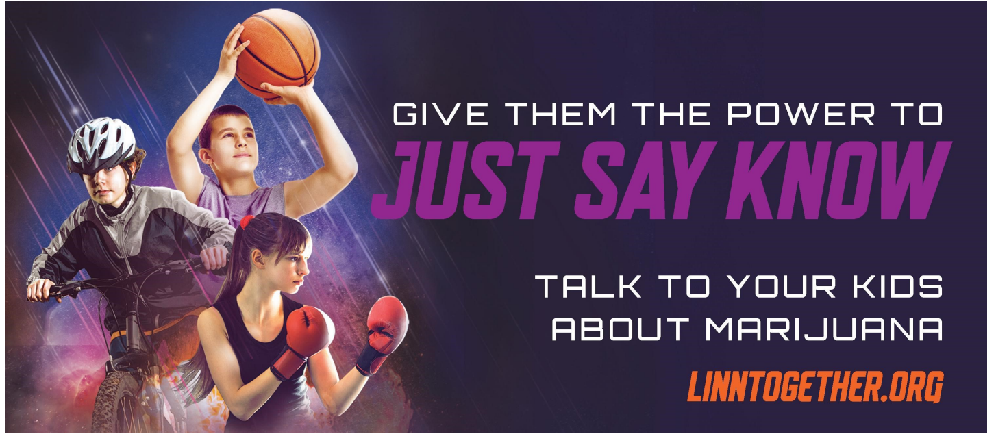
Artwork from the Linn Together youth marijuana prevention campaign developed in collaboration with the Linn County Sheriff’s Office and the Linn County Juvenile Department.” As part of the DFC grant we will be creating a second phase of the campaign.