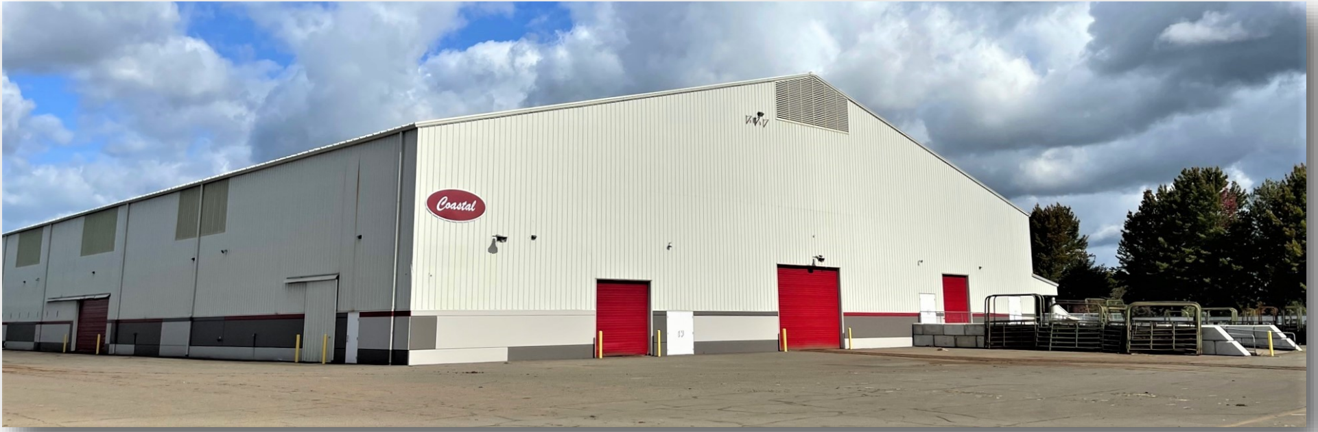
Linn County Fair & Expo Center buildings sport newly painted red doors. The last time the buildings were painted was in 2005.