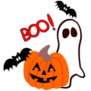
Linn County employees get into the spirit of Halloween!