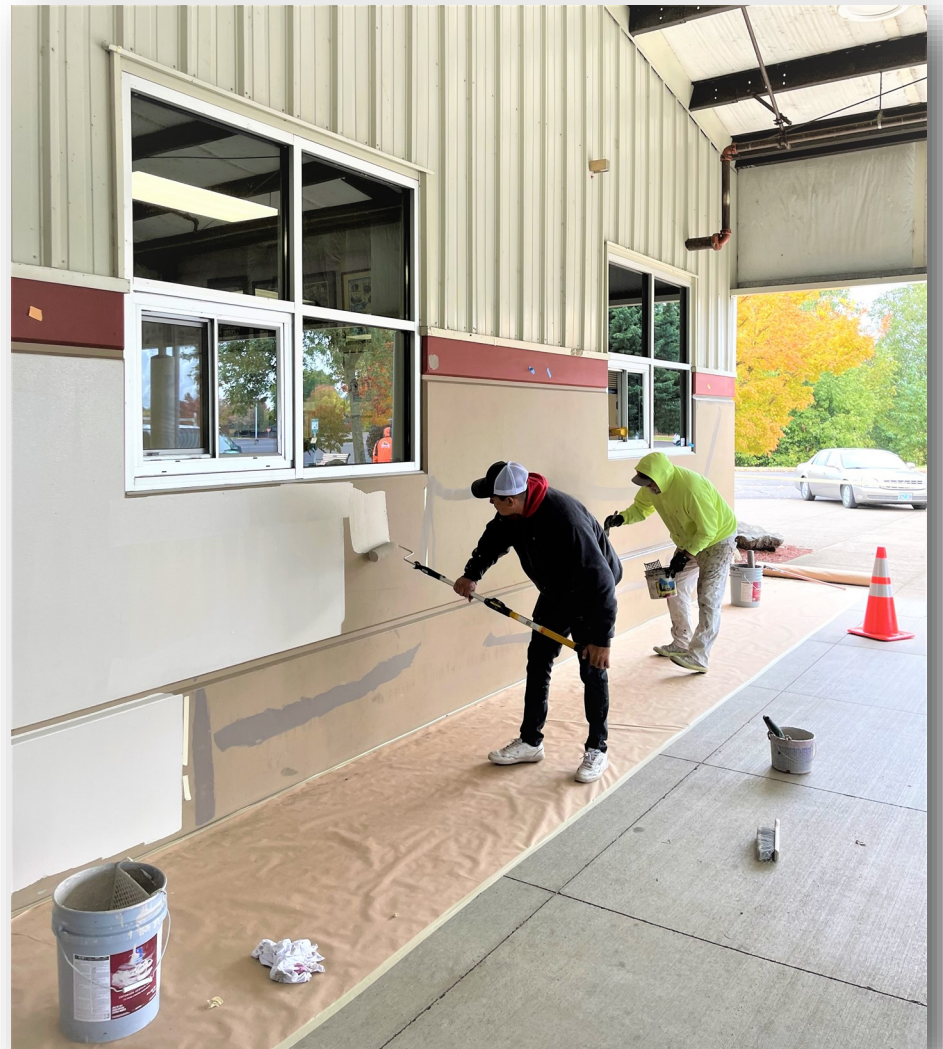
Photos: Staff from McClinton Painting hard at work giving the buildings at the Linn County Fair & Expo Center a new coat of paint.