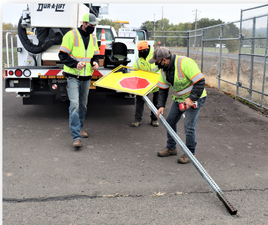
ODOT employees prepare new solare powered warning lights for installation on Richardson Gap Road, south of its intersection with Highway 226.

clear. “Always approach intersections expecting other traffic and pedestrians,” Mink said.