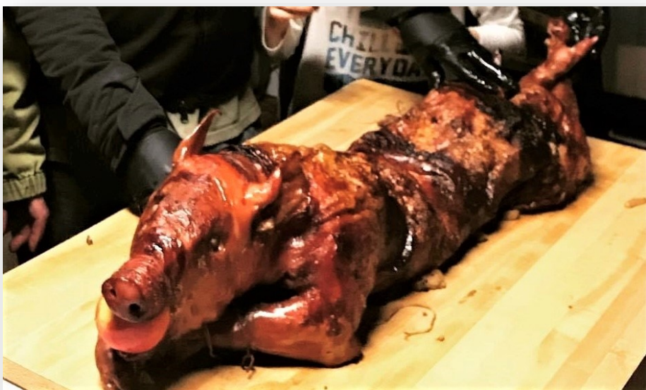
Roast suckling pig will be enjoyed on January 7, Christmas (Bozic) for Eastern Orthodox Christians.