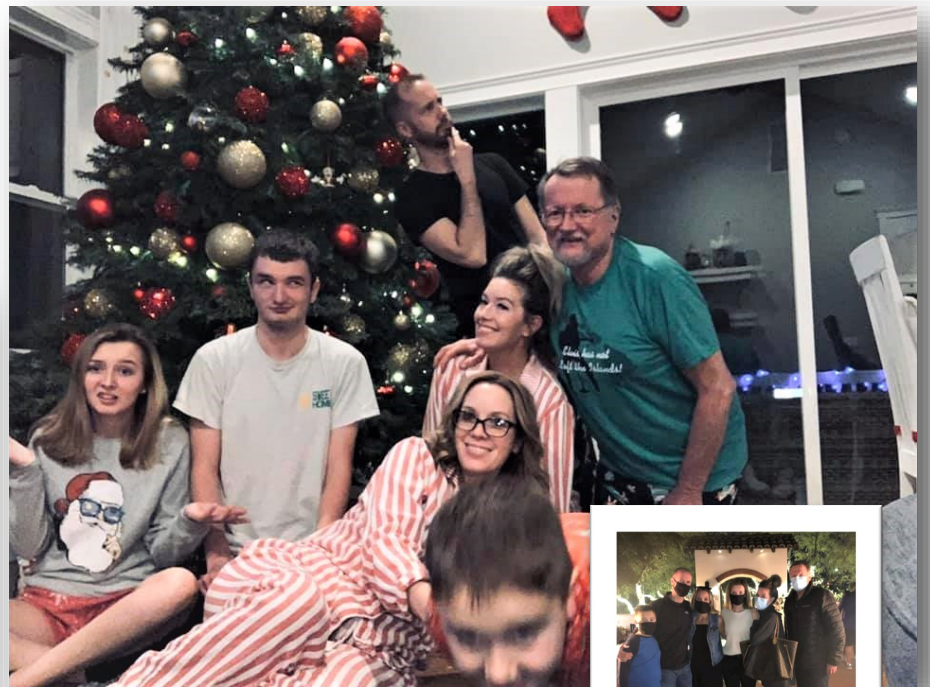
Christmas 2019, above, and 2020, right.