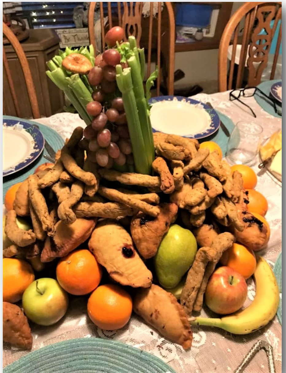
Homemade goodies including apricot turnovers and garlic potato sticks and fresh fruit are the key ingredients in the Italian "Christmas Tree" center piece that is a focal point of our family holiday traditions