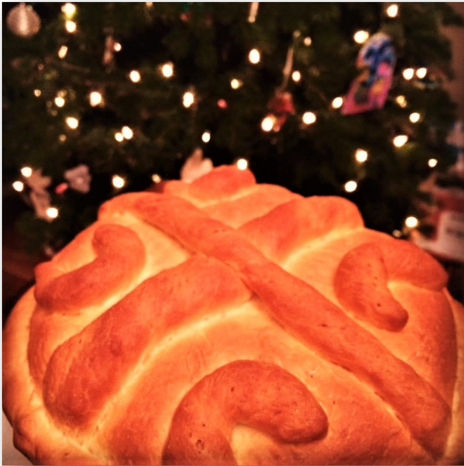
At the Daudert home, family members will try to find a coin baked in a round loaf of bread to have good luck for the coming year.