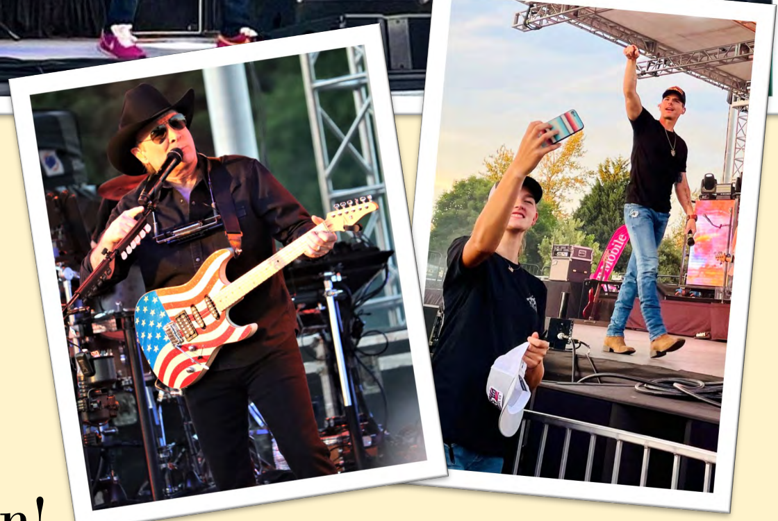
2023 entertainers: Smash Mouth, Clint Black and Granger Smith.