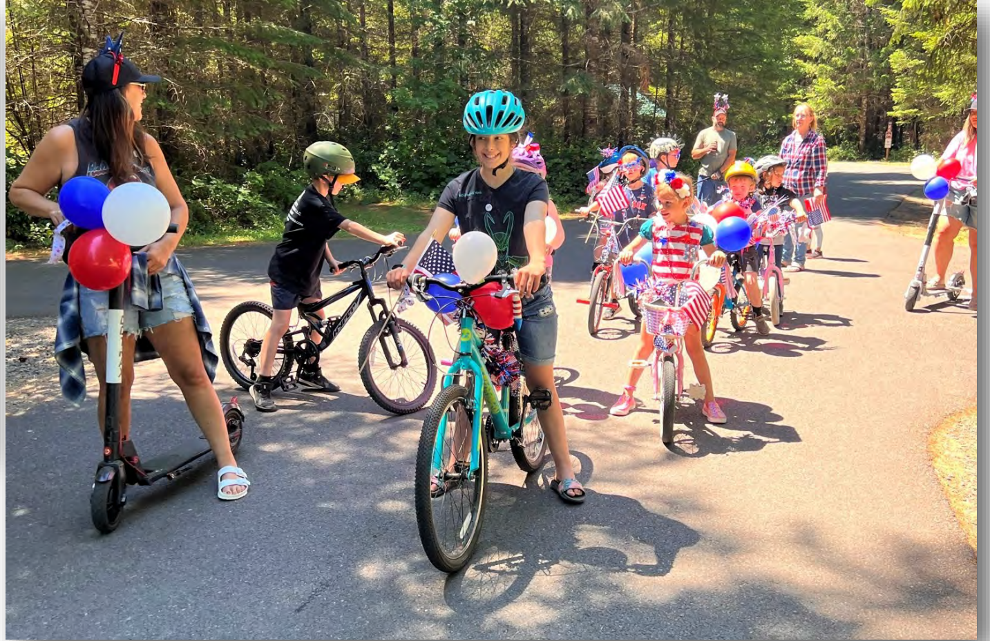
Lining up for the annual grand bicycle parade.