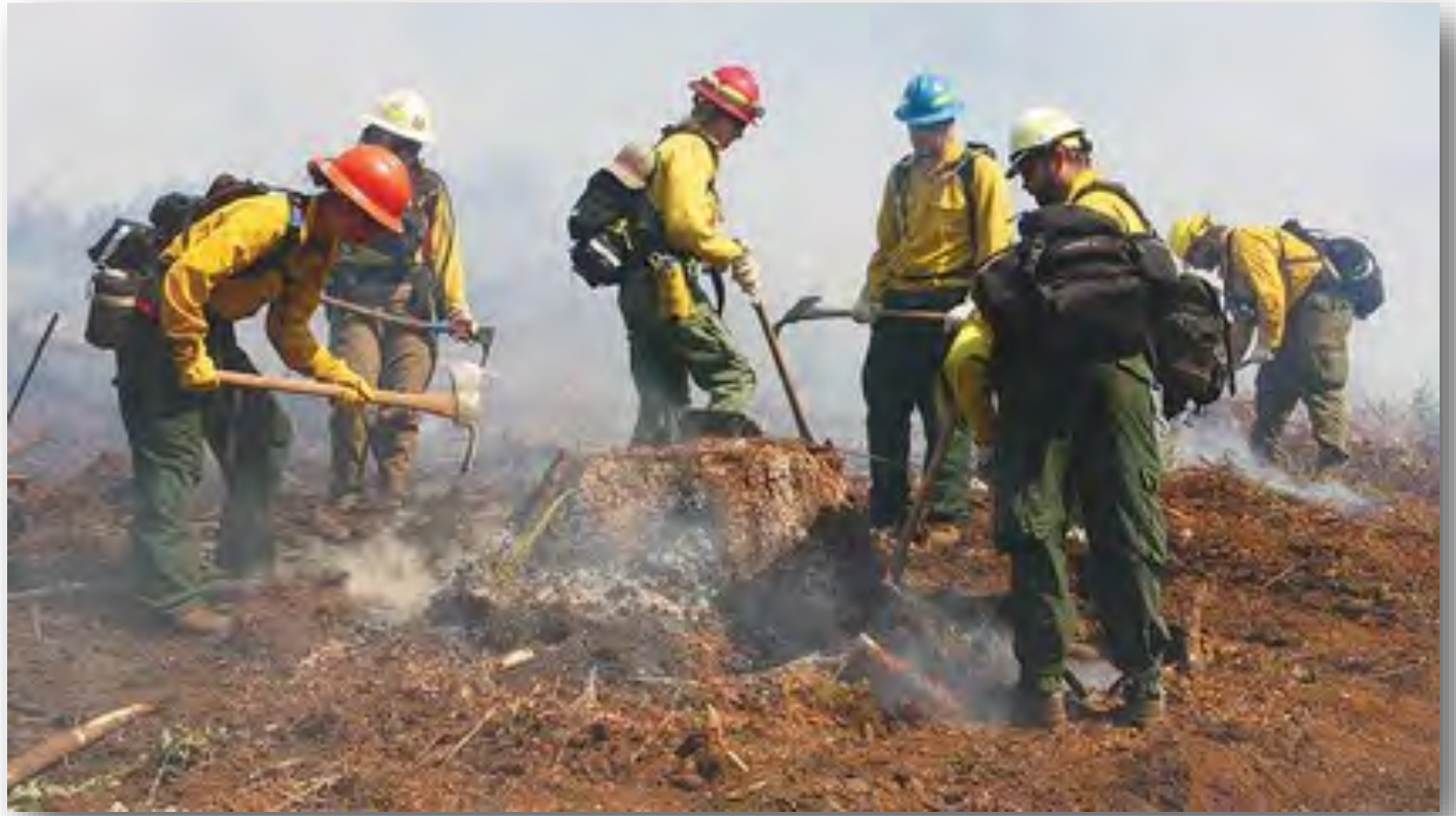
More than 200 wildland firefighters from around Oregon participated in fire school in late June in Sweet Home.

"But then it comes down to how people are building homes in the wildland urban interface, and that's a pretty valuable resource as