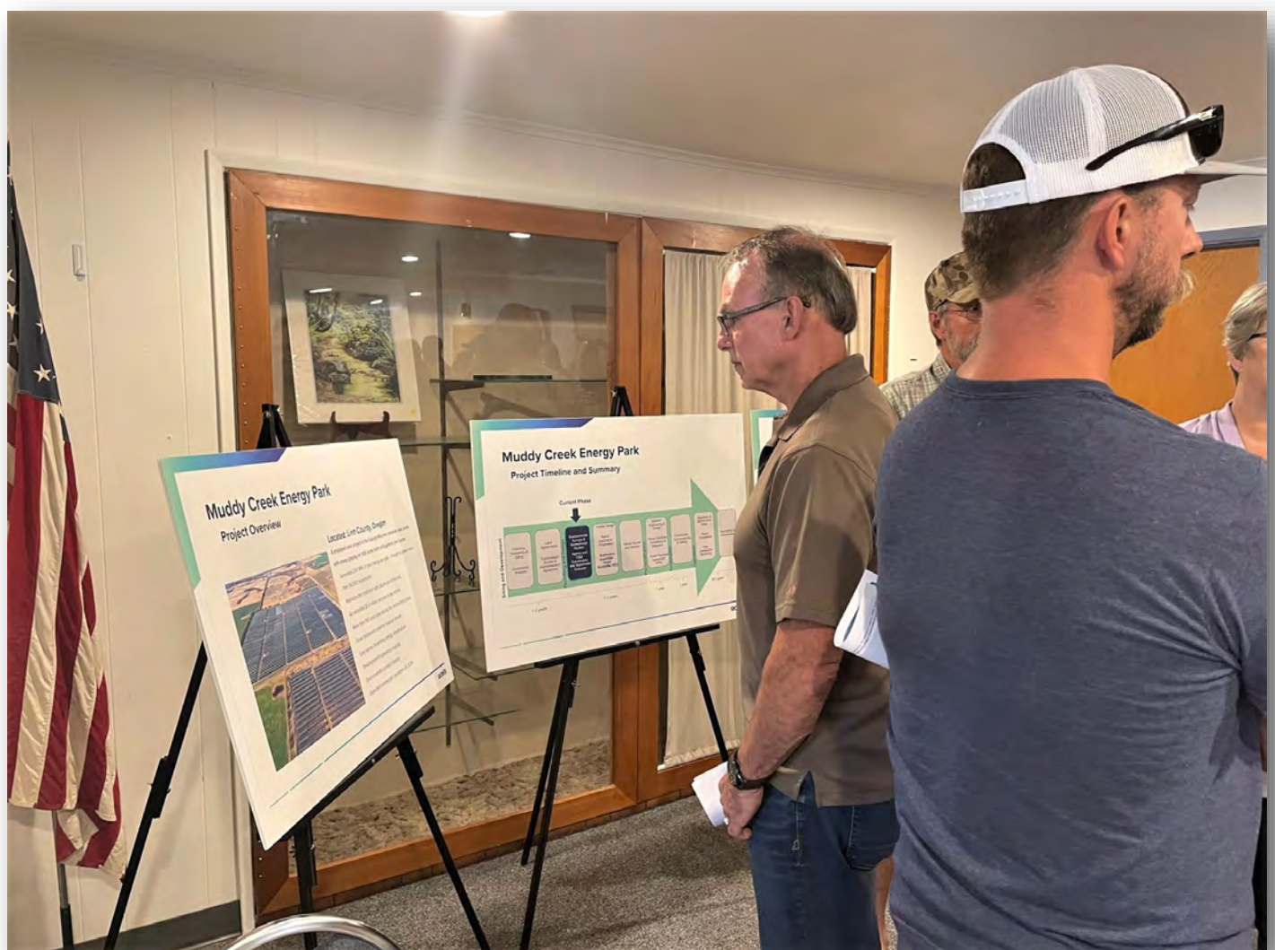
One of more than 100 people who attended the meeting, reviewing information boards.