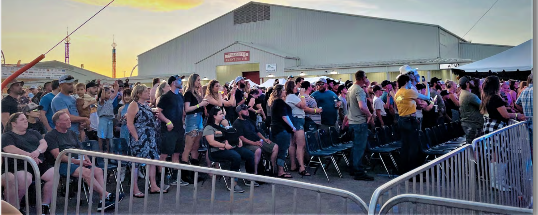
It was hot Saturday, July 15, at the Linn County Fair, about 98 degrees during the day, but it cooled off by the time Granger Smith took the Main Stage.