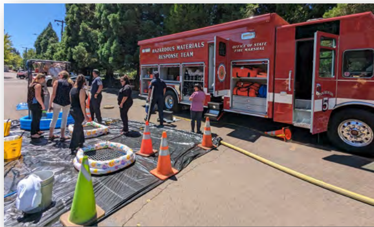
HAZMAT 5 team and Region 2 Healthcare Coalition members.