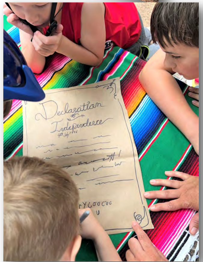
Learning about our country's history, above, and making a copy of the Declaration of Independence.